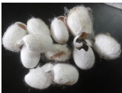
Figure-7. Uzi Pupae collected from cocoons